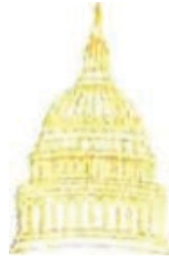
JOHN LEWIS Member of Congress