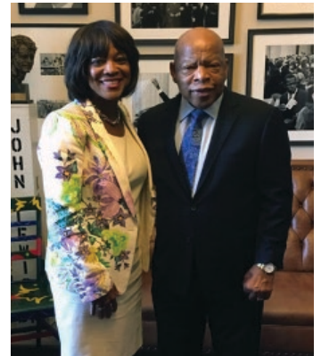
John Lewis Member of Congress

Editor's Note: Congressman Lewis graciously shared this message with us just before his passing on July 17 after a lifetime spent in service to others. We mourn the loss of this civil rights icon and dear MSM friend, who delivered the keynote address for our 33rd Commencement exercises. We thank Congressman Lewis for his leadership in creating and advancing health equity. Godspeed.