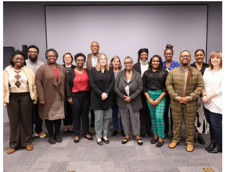
Writing, Dissemination and Reviewing Workshop MSM PRC Staff, Community Coalition Board Co-chair, Community Campus Partnerships for Health, and Progress in Community Health Partnership

Since our last issue, we submitted our plan to continue another five years as a Centers for Disease Control and Prevention Research Center, led Morehouse School of Medicine's 9th Annual Community Engagement and hosted the 2023 Community Unsung Heroes Awards in collaboration with the American Public Health Association Annual Exposition and collaborated with Community Campus Partnerships for Health for the Writing, Dissemination and Reviewing Workshop. The event was designed to expose community and campus leaders to skills, tools, and tips to equitably navigate writing the stories of how they conduct collaborative initiatives in response to identified needs, strengths, and priorities. We are excited to share the community relationships, resources, and research underway in this issue. We also look forward to learning how we can serve and collaborate with you to support communities that live their best lives possible.