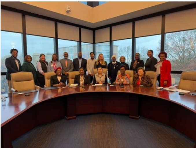
PRC Director participates at the Morehouse School of Medicine Environmental Justice Conversation on Friday, 12/1/2023. Representatives from HHS/OASH-ORHO and EPA Region IV

https://www.msm.edu/Research/research_centersandinstitutes/PRC/index.php